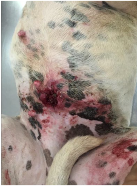
Figure 1: Overall abdomen appearance of the animal with an ulcerated and difficult to heal abdominal lesion.

30CH ( 1 \times 10^{-60} ), three drops, SID, for 30 days; and Omega 3 2000 mg, SID, for 60 days, were orally prescribed. It was recommended for the animal to begin a low-carb diet containing 10% carbohydrate. The tutor was also advised that the animal should come back at a 7-day interval for Viscum album D3 intravenously applications for 60 days.