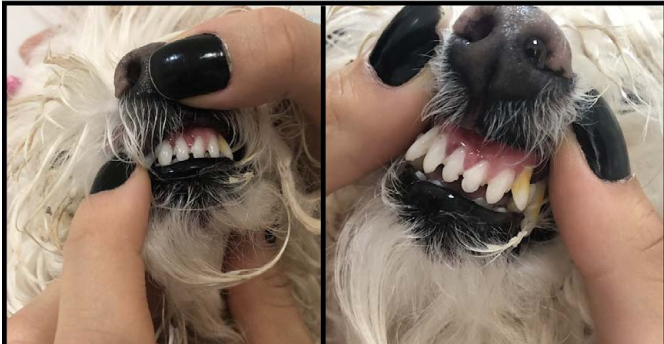
Figure 4: Appearance of the region previously diagnosed with SCC. Result of the treatment 30 days after Viscum album applications. Both images demonstrate the disappearance of the tissue between the upper lip and gum, previously seen, and the edema reduction in the superior lip.

improvement in the animal's overall condition, improved appetite, sleep quality, and mood. The animal also returned to show interest in playing as she previously used to do. After 30 days of treatment, the affected site was completely restored (Figure 4).