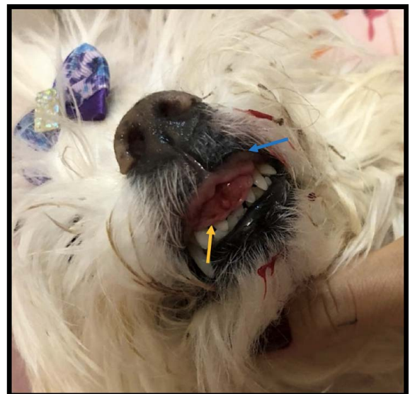
Figure 2: Appearance of the initial lesion. Blue arrow: increased volume of the upper lip with edema. Yellow arrow: mass adhered between upper lip and gum, diagnosed by biopsy and histopathology as squamous cell carcinoma.

The patient returned to the clinic for the second Viscum album intravenous application, and the mass had surprisingly reduced about 90% of its total size, compared to the initial lesion, remaining only a slight edema on the upper lip (Figure 3). The tutor reported